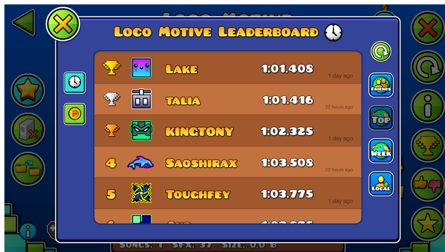
Figure 3: Platformer Level Leaderboard.

Since gameplay of Platformer levels does not go left to right at a set rate for every player, their leaderboards focus on either Time or Points. An example of the former, which is the default view, is shown in figure 3. Here, scores are sorted by fastest completion time from start to finish. This means that you have to complete the level for your time to appear.