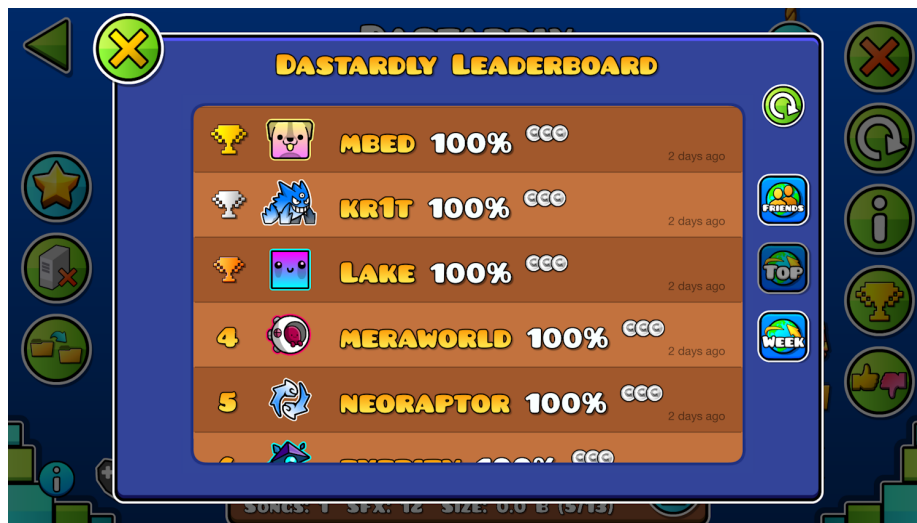
Figure 2: Classic Level Leaderboard.

The leaderboards for both Classic and Platformer levels are found on their level page. It is opened by clicking the trophy button, which is seen on the far right of figure 2. This figure shows an example of a leaderboard for a Classic level. By default, it shows players globally in order of highest completion progress, indicated as percentage. If there are ties, such as in this example with multiple people having 100%, it is ordered by amount of User Coins collected if the level has them. However, if User Coins are also tied for several players, or the level does not have User Coins, time of completion is the tiebreaker. This means that whoever submitted the tied score first is shown first. Scrolling down lets you see up to 200 players.