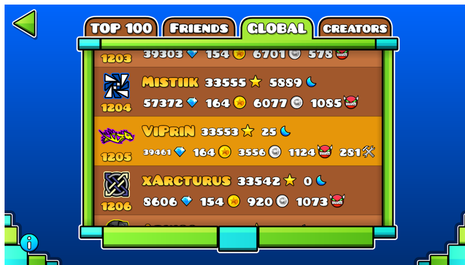
Figure 1: The Global Leaderboard.

The Global Leaderboard is the main one, and is seen in figure 1 below. It shows players in order of Stars, the statistic to the right of each player's username, ranked from highest to lowest. As you may know, Stars are rewarded when you complete the main levels, but also by playing rated user levels, for example through the Featured list. The amount of Stars vary from 1 to 10 depending on the Difficulty of the rated level.